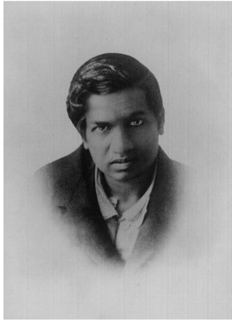
Fig 3: Srinivasa Ramanujan

Ramanujan's journey into the world of mathematics began with an encounter with a copy of George Shoobridge Carr's "Synopsis of Elementary Results in Pure and Applied Mathematics." This compendium of mathematical theorems, though outdated and lacking in explanatory detail, sparked the flames of Ramanujan's genius, inspiring him to explore the realm of numbers and equations with unparalleled fervor.