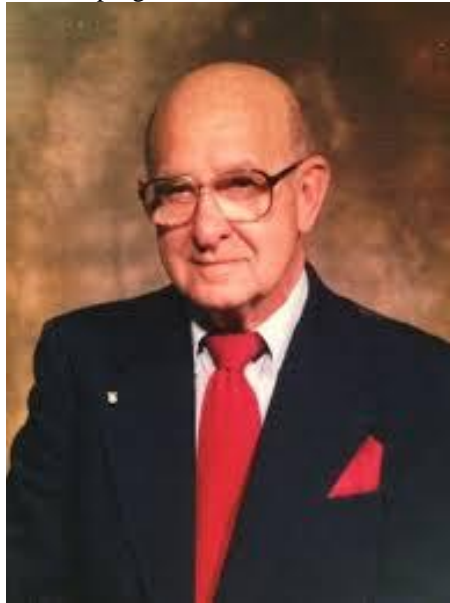
Fig. 4: Arthur Charles Cole

boundless intellect propelled him towards a life of scholarly inquiry and humanitarian advocacy, leaving an indelible mark on the landscape of mathematics and social progress.