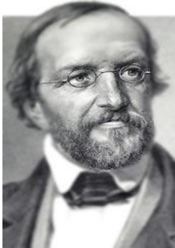
Fig. 5: Johann Peter Gustav Lejeune Dirichlet

Central to Dirichlet's legacy is his groundbreaking work on Dirichlet's theorem, a fundamental result in number theory that addresses the distribution of prime numbers in arithmetic progressions. Building upon the pioneering work of his predecessors, including Carl Friedrich Gauss and Adrien-Marie Legendre, Dirichlet formulated a rigorous proof demonstrating the existence of infinitely many prime numbers of the form an+b , where a and b are coprime integers—a result that revolutionized the field of number theory and laid the groundwork for future developments in analytic number theory.